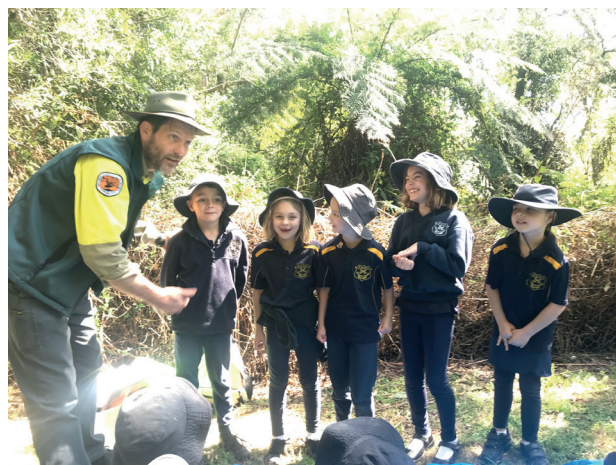
Kinder and Year 1/2 students enjoying their excursion to Fitzroy Falls Visitor Centre.