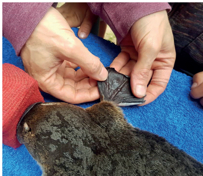
Measuring research on Platypus

More information to follow. Your child will be bringing home an information pack as soon as possible and we apologise for this delay. For any questions, please phone Bomaderry High School on (02) 4421 0699.