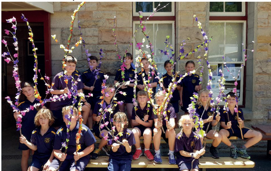
Class 3/4SG, with the help of the CMRI volunteers made decorations for the Show Pavilion for 2020.