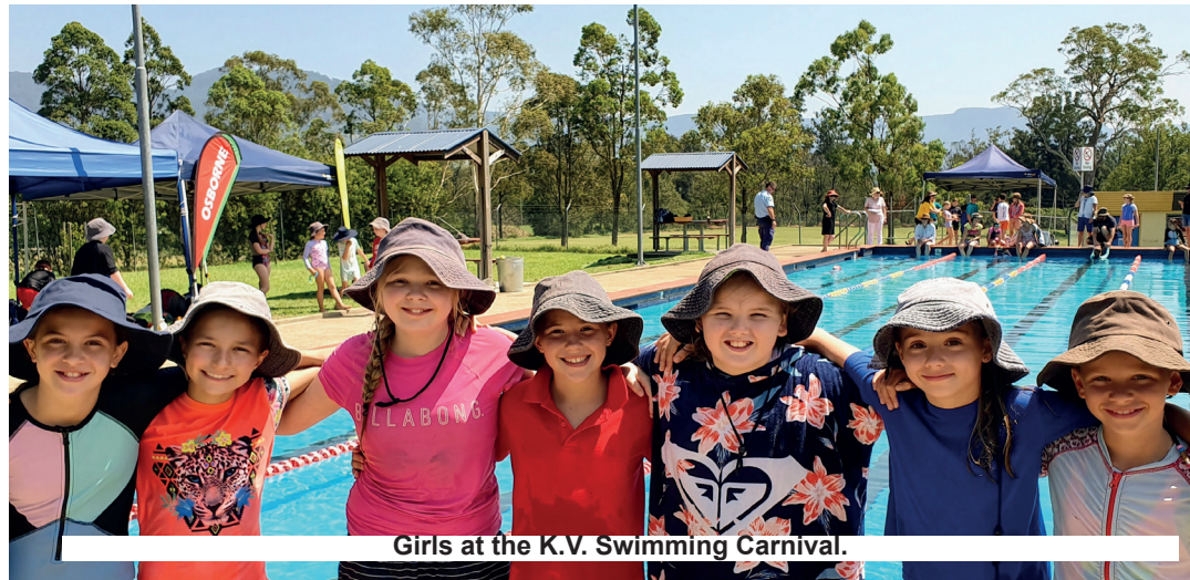
Girls at the K.V. Swimming Carnival.